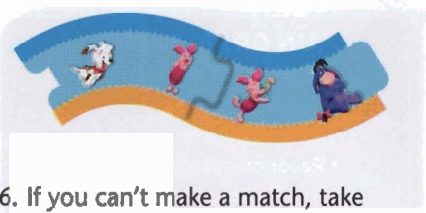
FIGURE 2 LOOK, YOU MADE A PIGLET MATCH!